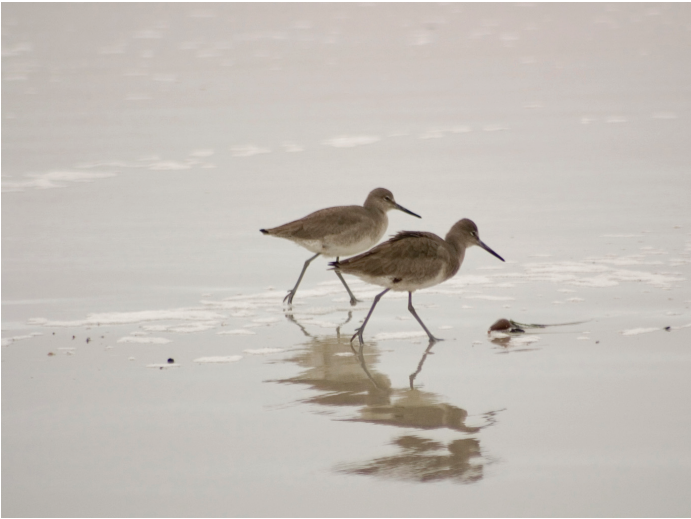
Willets ( Catoptrophorus semipalmatus ) foraging for mole crabs on Asilomar Beach.

Photosynthesis is limited to microscopic algae in the top few centimeters of the sand. Some beach animals survive by eating these minute algae particles. However, most sandy beach organisms depend on the waves to bring them food.